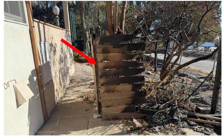
Figure 4: Fire personnel cut away the gate to keep the fire burning along the fence from reaching the house.

one building succumbed, and the other did not? Or was there someone who helped extinguish a fire in a building? This is because once a portion of a building ignites, it generally takes some form of human intervention to prevent further fire spread. In big conflagrations like the Eaton and Palisades Fires, where crews are spread thin, small interventions can be very effective and involve removing fence panels to prevent the fire from traveling to the house, spraying water on burning vegetation, moving a burning door mat, or using an axe to cut away burning vegetation. These actions largely contributed to homes surviving the 2025 Los Angeles Fires. In the days and weeks following damaging fires, scientists and crews from CAL FIRE collect data to answer critical questions about whether there are signs of home hardening actions or defensible space in action. More detailed studies, such as those done by the National Institute of Standards and Technology (NIST), take much longer and involve reconstructing fire progression through in-person interviews, reviewing security camera footage, and extensive fieldwork.