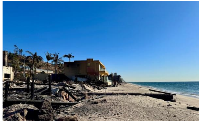
Figure 2: The Palisades Fire burned to the beach, taking many homes along the coast in its path. Some of the surviving buildings illustrated effective home hardening, such as having dual-paned tempered glass windows.

Many surviving homes had dual-paned, tempered glass windows and noncombustible siding. Dual-paned windows perform far better with radiant heat exposure than single-pane windows, which are common in buildings built before the 1970s (and in most homes in these fire footprints).