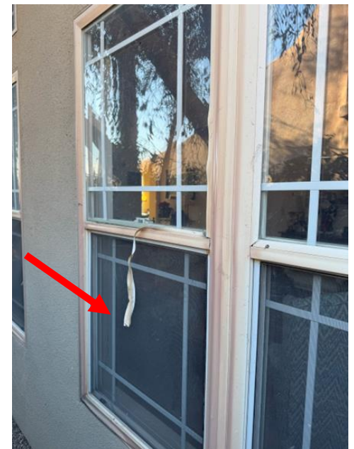
Figure 6: Radiant heat damaged this window. Note the vinyl glazing is deformed. In some cases radiant heat led to window panes breaking or falling from the frame.