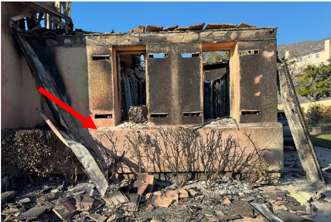
Figure 3: These woody shrubs likely contributed to the radiant heat damage that broke the window in this home. Implementing a 5-foot noncombustible perimeter (Zone 0) is best practice.