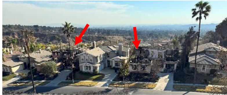
Figure 1: Not all homes burned in the Eaton Fire footprint. In most cases, fire suppression activities were key to buildings surviving the fire.

Post-fire studies and laboratory experiments offer essential information about how local construction and landscaping practices affect building and property vulnerabilities. Assessments following the 2025 firestorms in Los Angeles provide key information and add to the body of research following other destructive wildfires in California, Colorado, and Hawaii over the last decade.