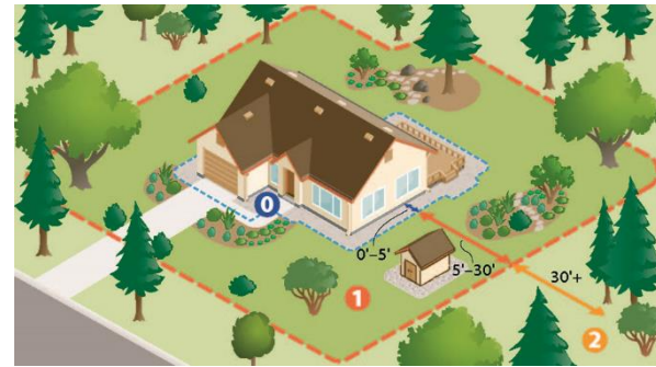
Figure 5: California’s 3-zone defensible space system is critical for fire mitigation.